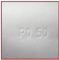
Embossed Media and Micron